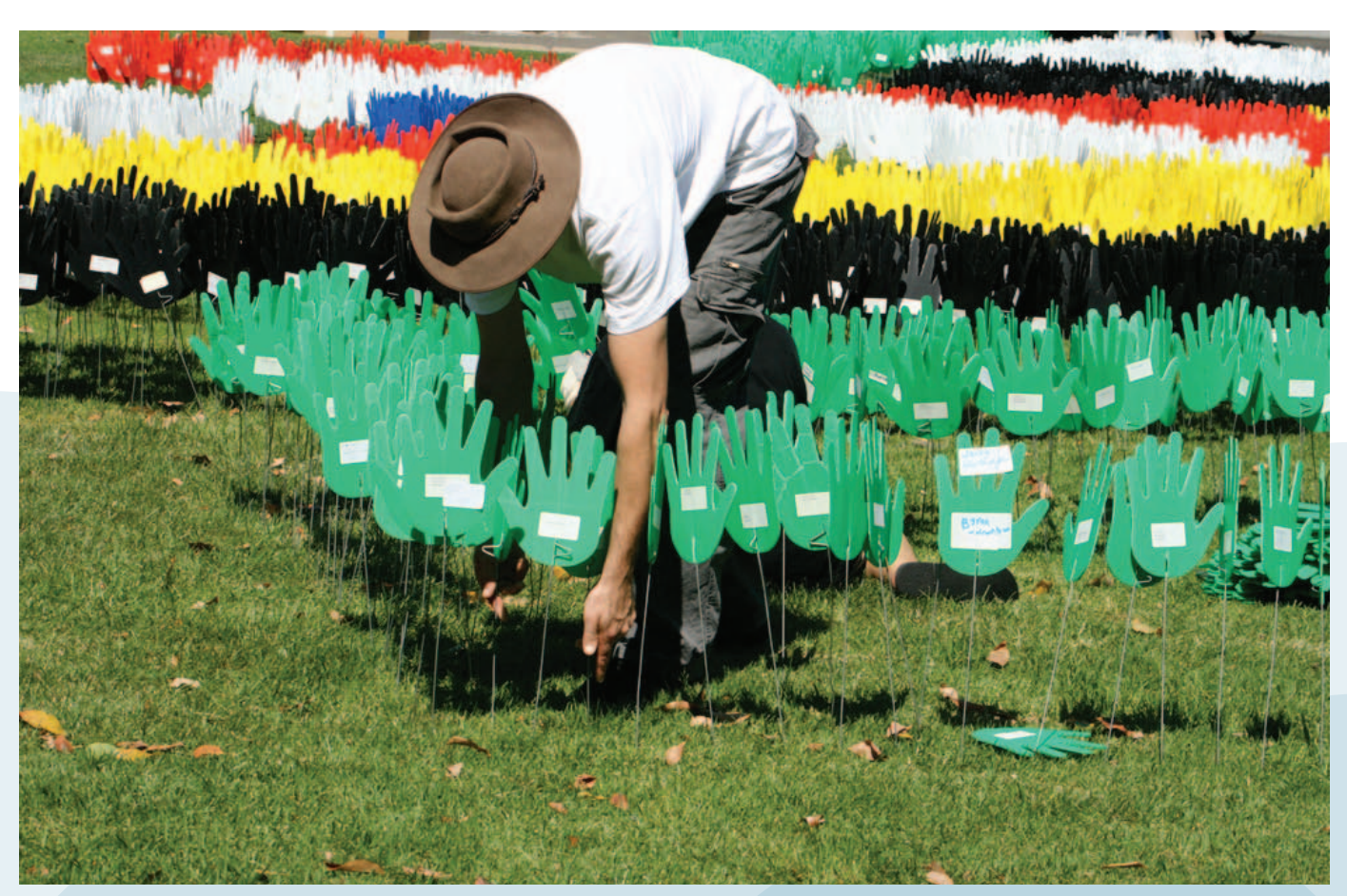
A volunteer planting the Sea of Hands in Sydney, November 2007.