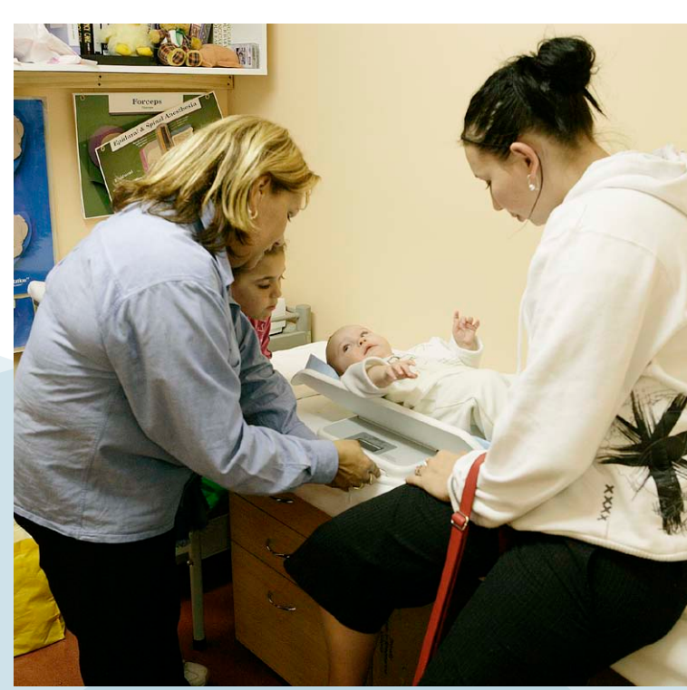
Baby checkup at an Aboriginal Medical Centre.

<u>Welcome to Country Protocols Policy</u>. Recognition of Aboriginal peoples' unique position in the history and culture of NSW.