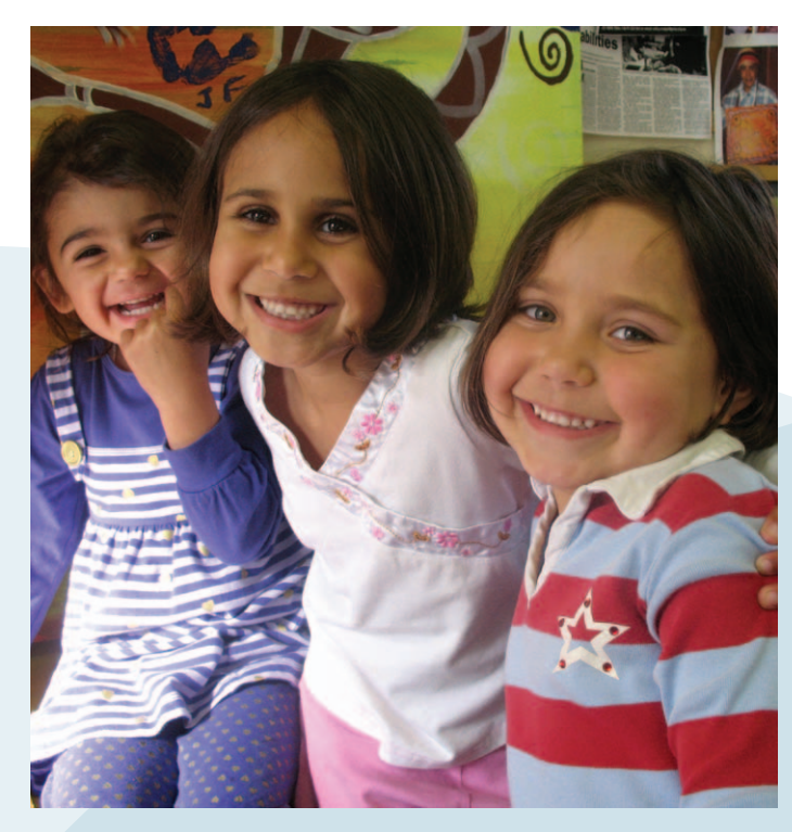
Girls attending NAIDOC Week celebrations at Penrith.