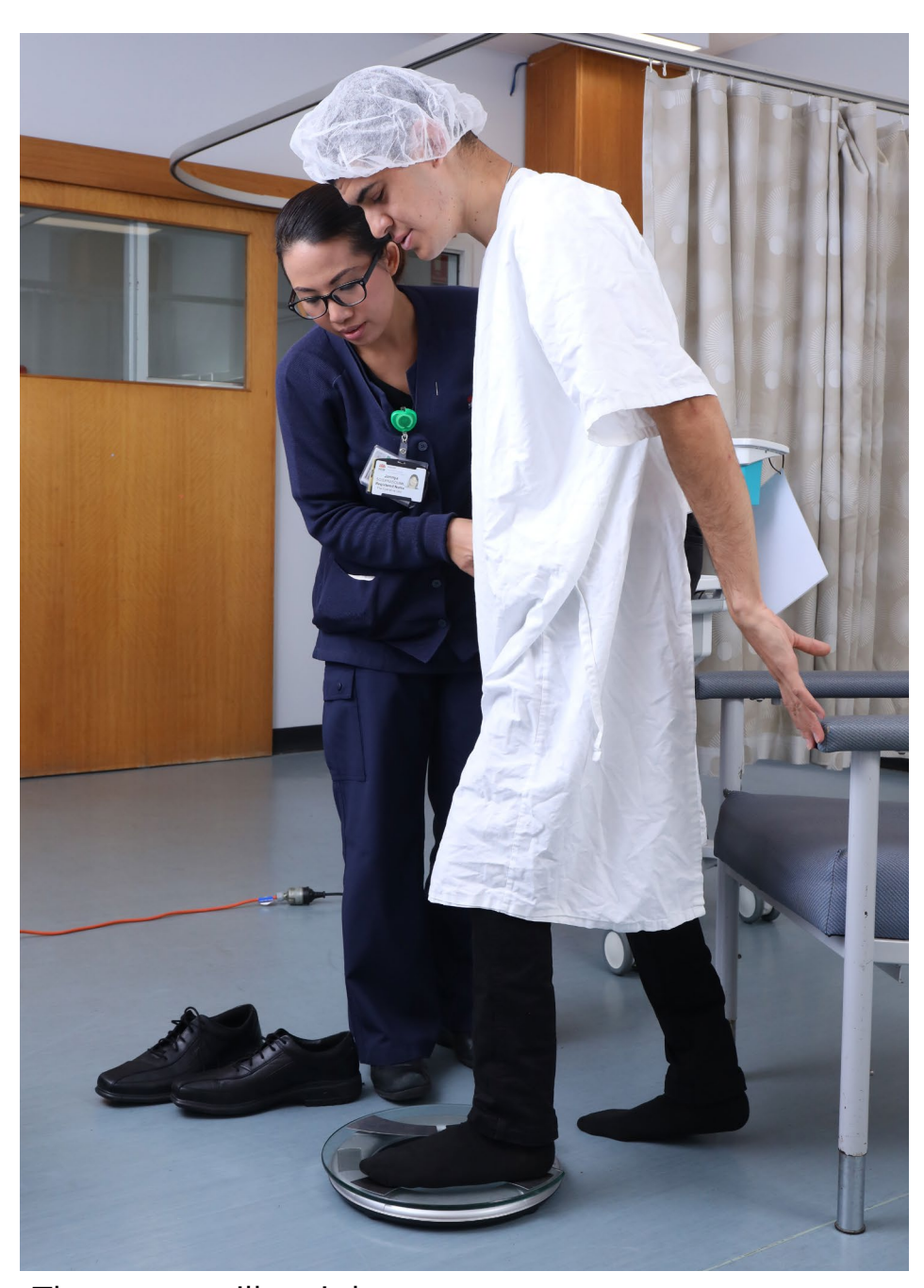
The nurse will weigh me.