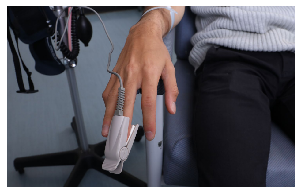
The nurse will put a clip on my finger.