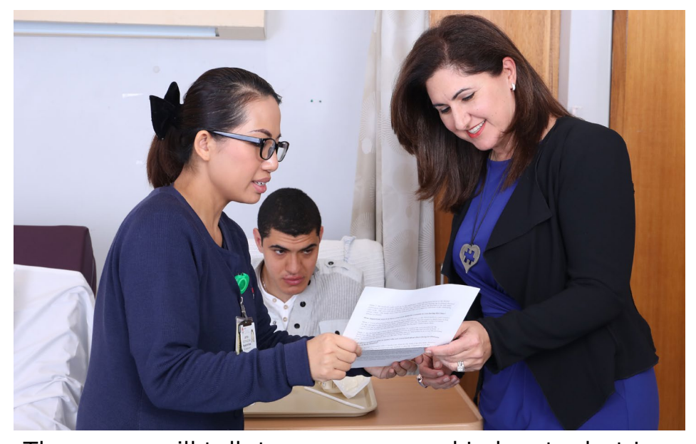
The nurse will talk to my carer and I about what I need to do at home and what medicines I need.