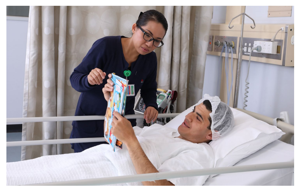
Now I am ready for my operation. I need to wait in bed.