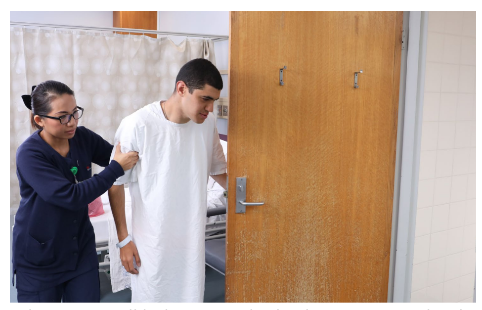
The nurse will help me to the bathroom to get back into my clothes.