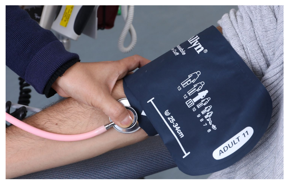
The nurse will take my blood pressure. They will wrap a band around my arm.