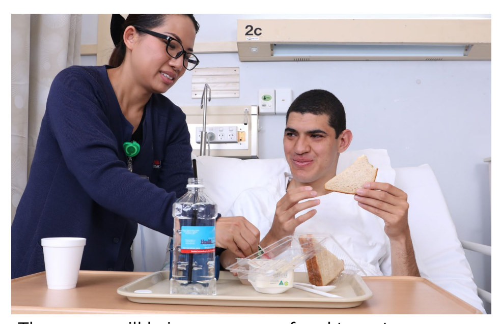
The nurse will bring me some food to eat.