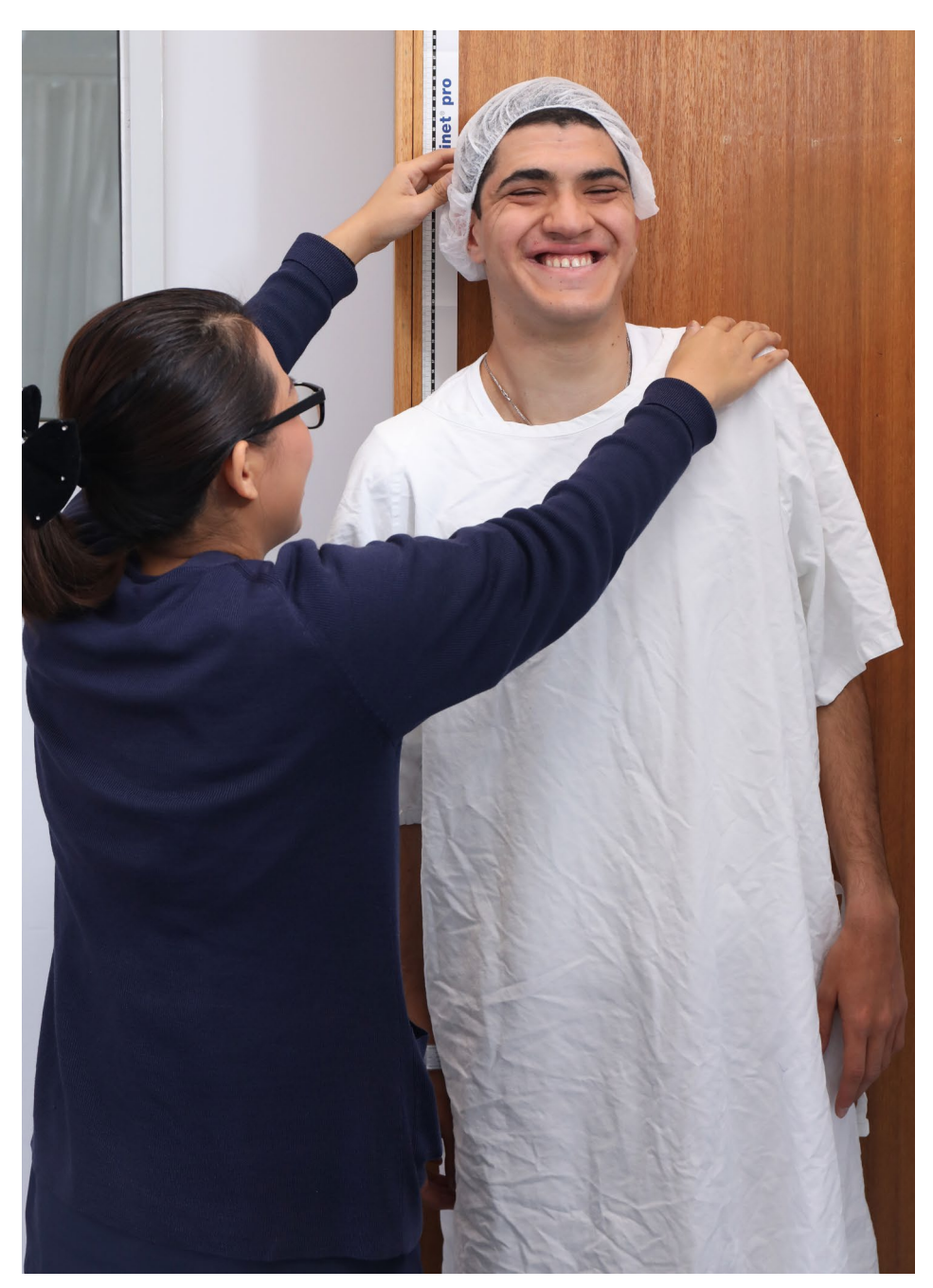
The nurse measures how tall I am.