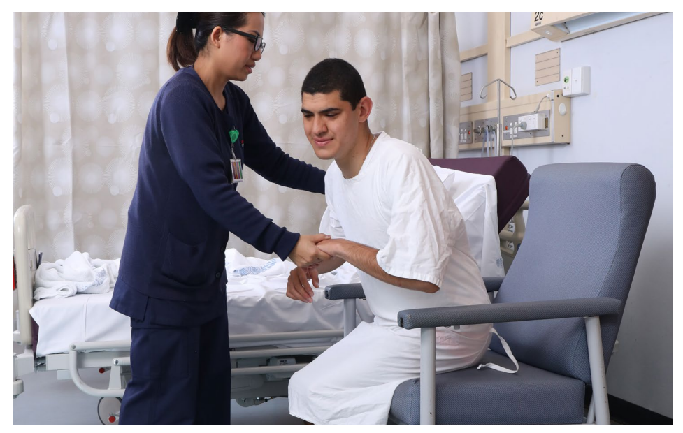
Then they will help me sit on the chair.