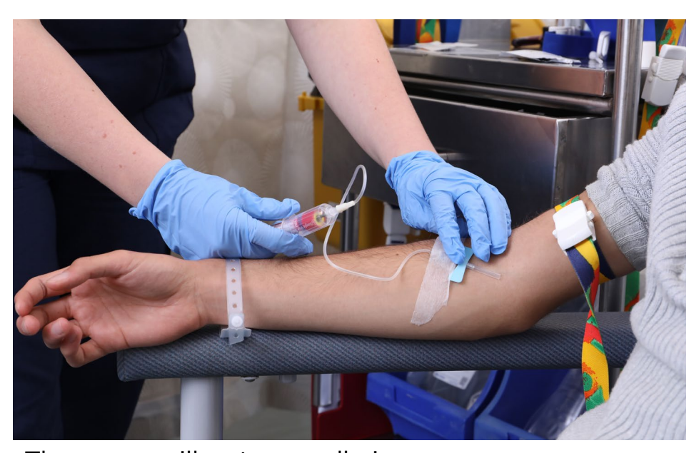
The nurse will put a needle in my arm.