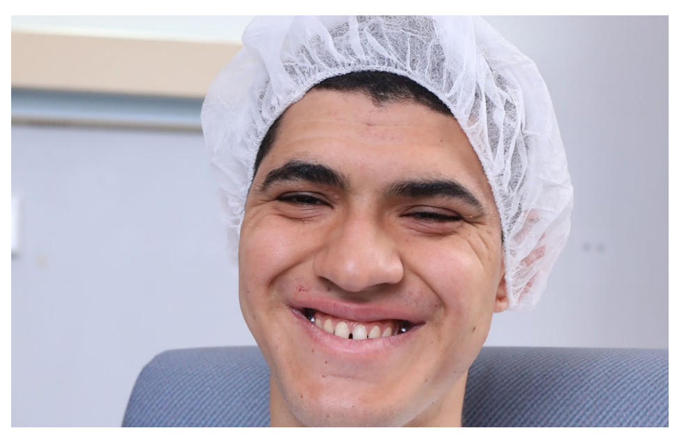
I have to get changed and put on a gown and cap.