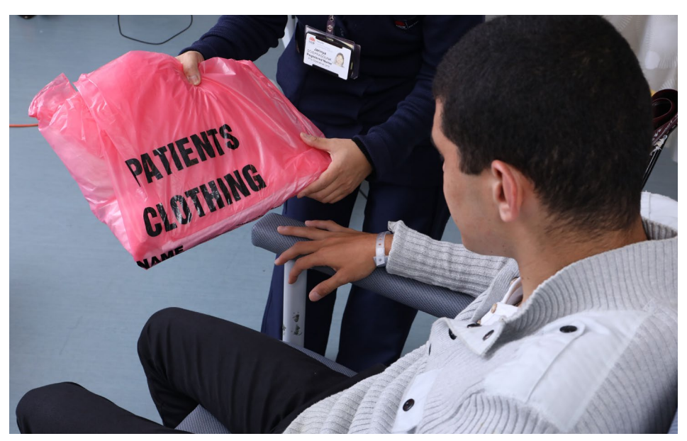
I can put my clothes in the pink bag.