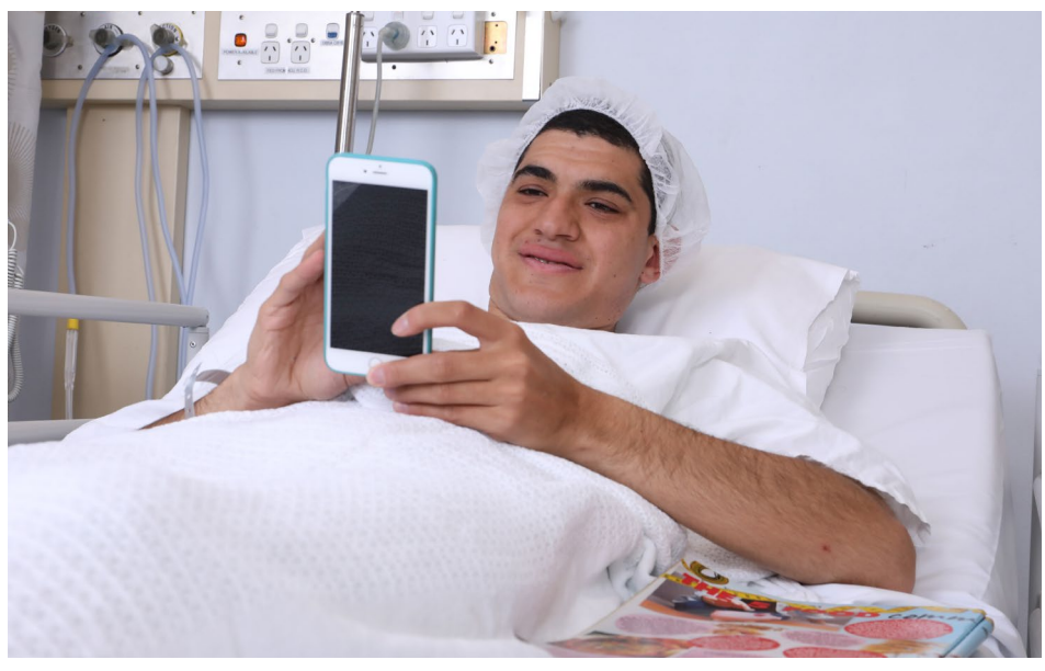
I can read a magazine or look at my phone.