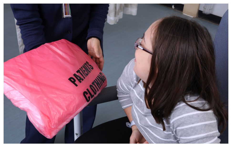
I can put my clothes in the pink bag.