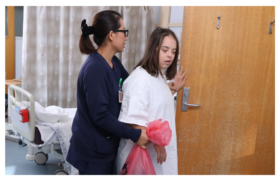
The nurse will help me go to the bathroom to get dressed.