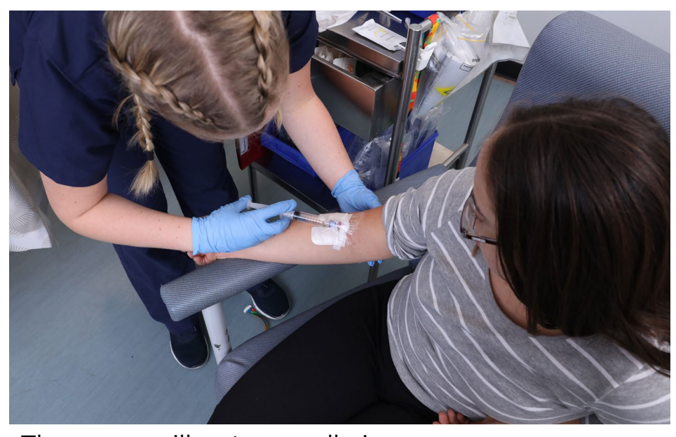
The nurse will put a needle in my arm.