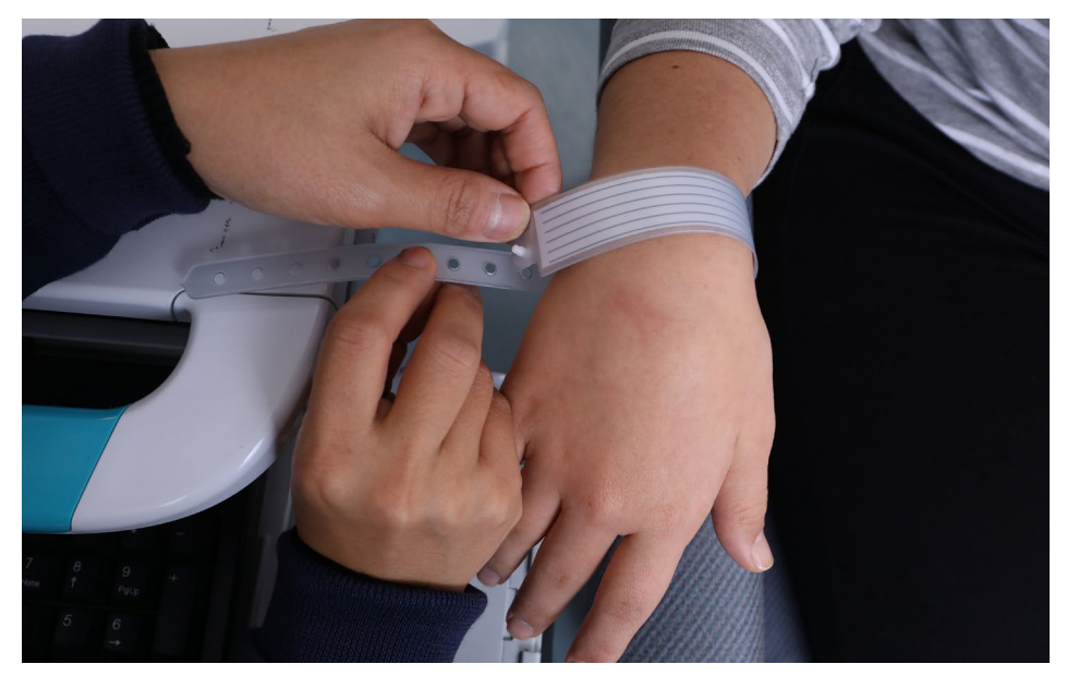
The nurse will put a band on my wrist with my name on it.