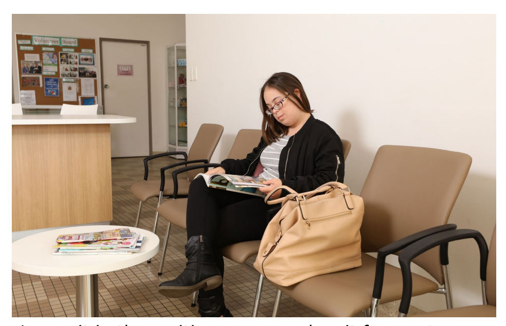
I can sit in the waiting room and wait for my turn.