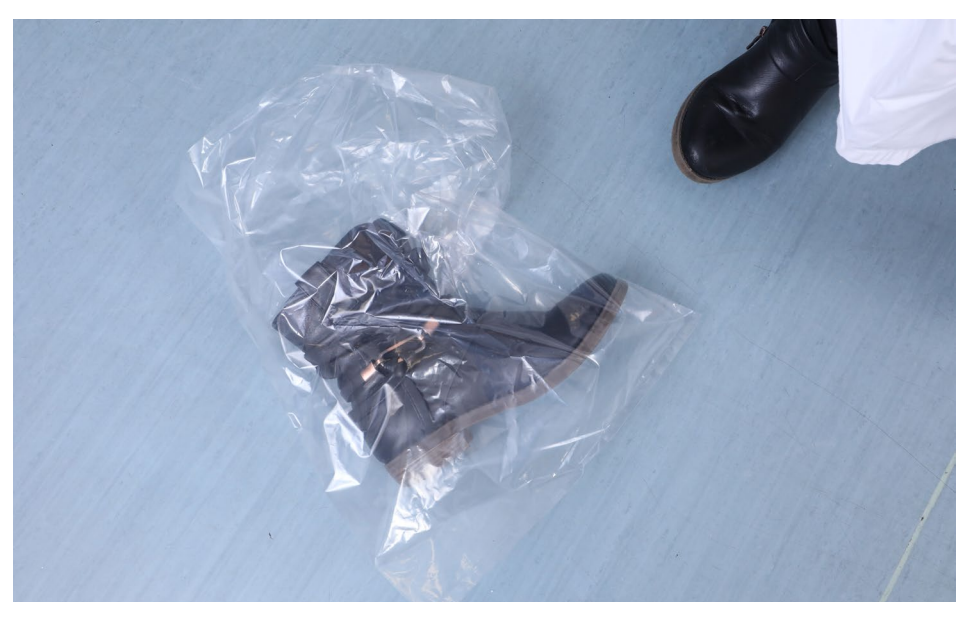
I have to take my shoes off and put them in a bag.