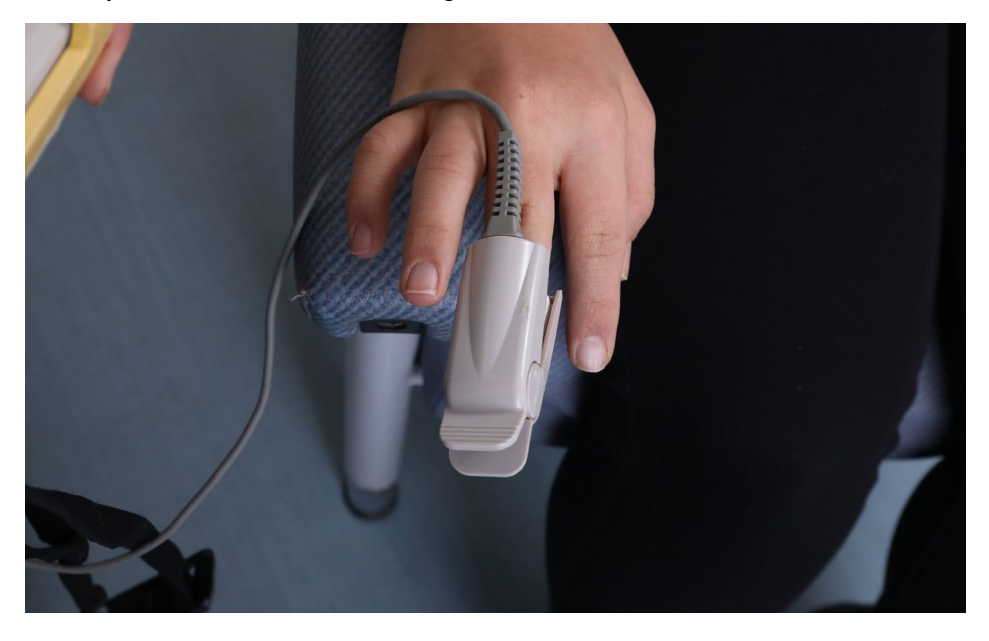
The nurse will put a clip on my finger.