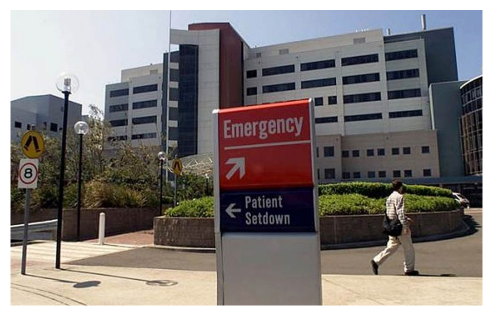
I arrive at hospital.