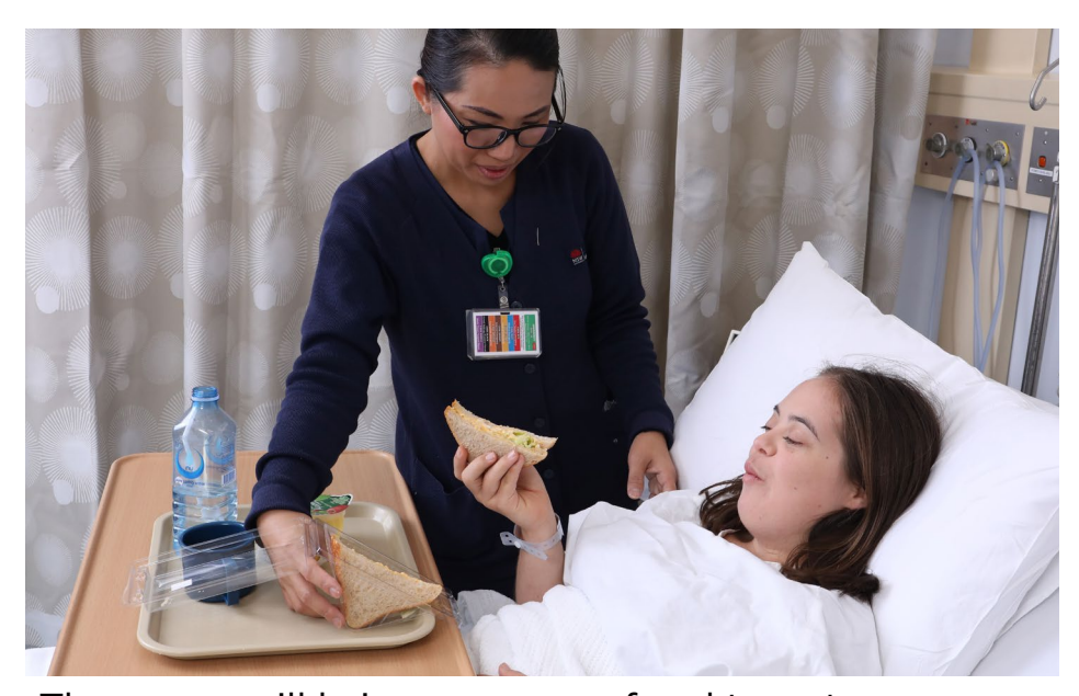
The nurse will bring me some food to eat.