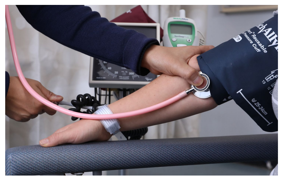
The nurse will take my blood pressure. They will wrap a band around my arm.