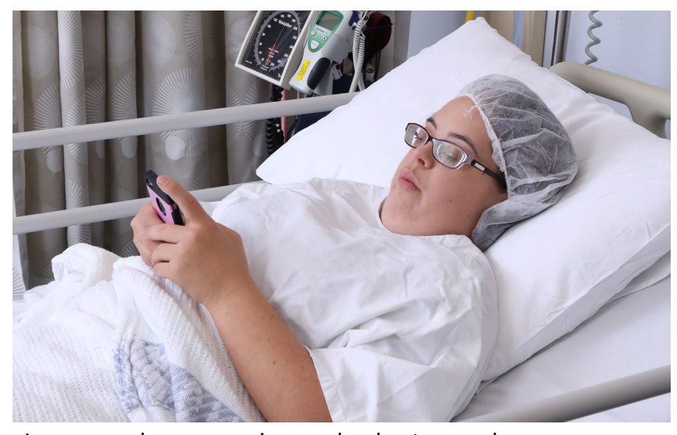
I can read a magazine or look at my phone.