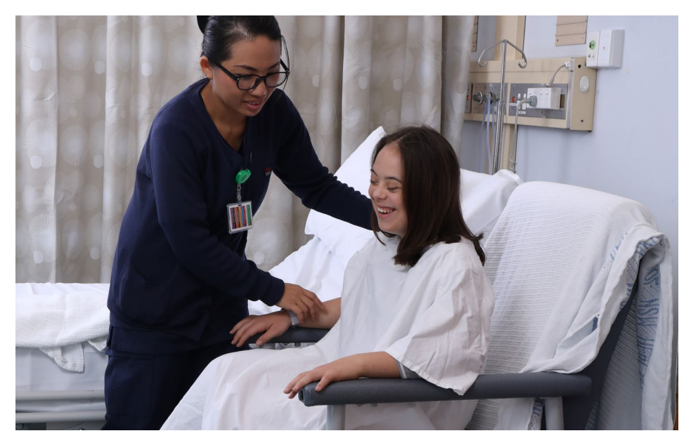
Then they will help me sit on the chair.