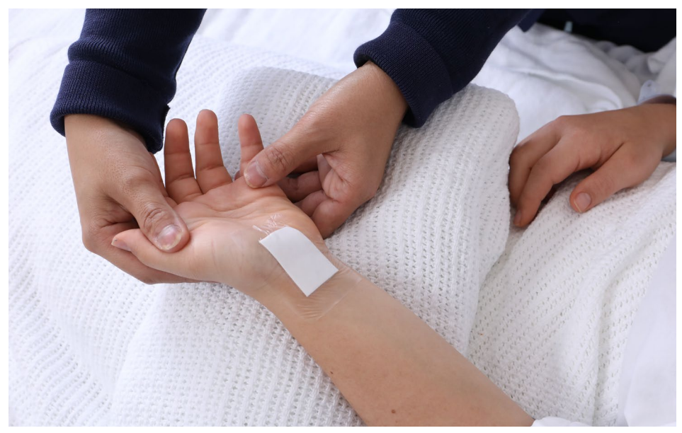
The nurse will check the bandages on my body where the doctors operated.