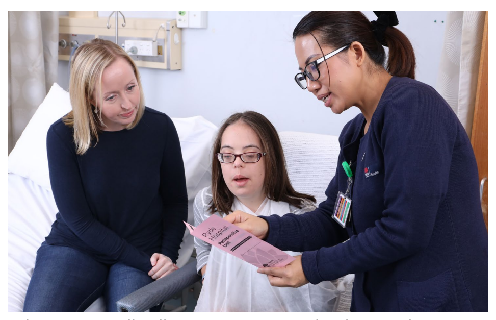
The nurse will talk to my carer and I about what I need to do at home and what medicines I might need.