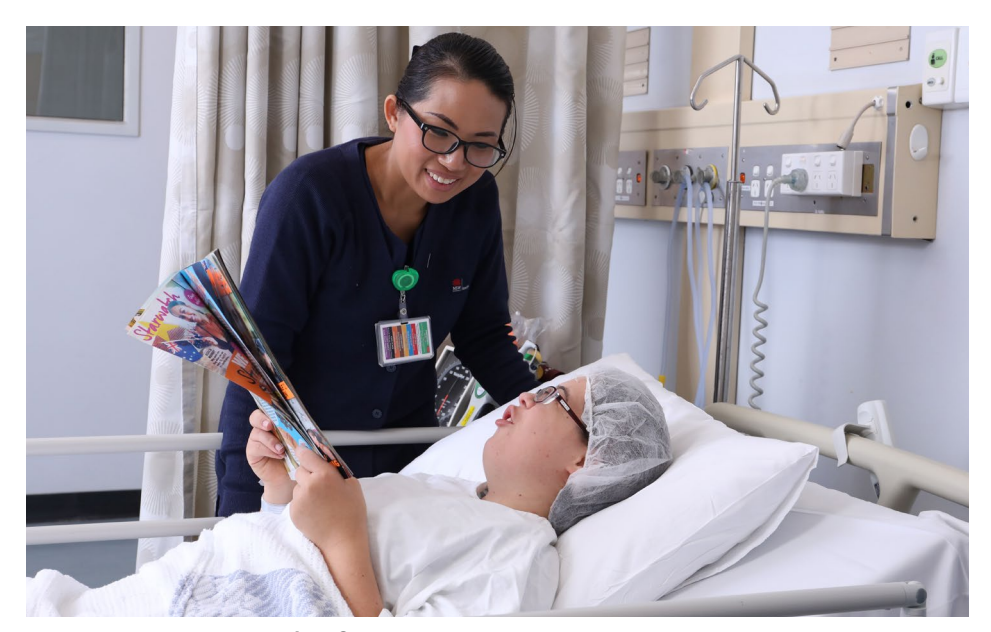
Now I am ready for my operation. I need to wait in bed.