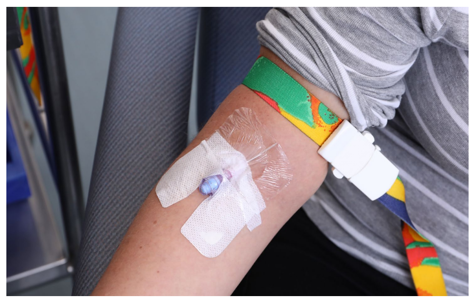
The nurse will put a tape around the needle.