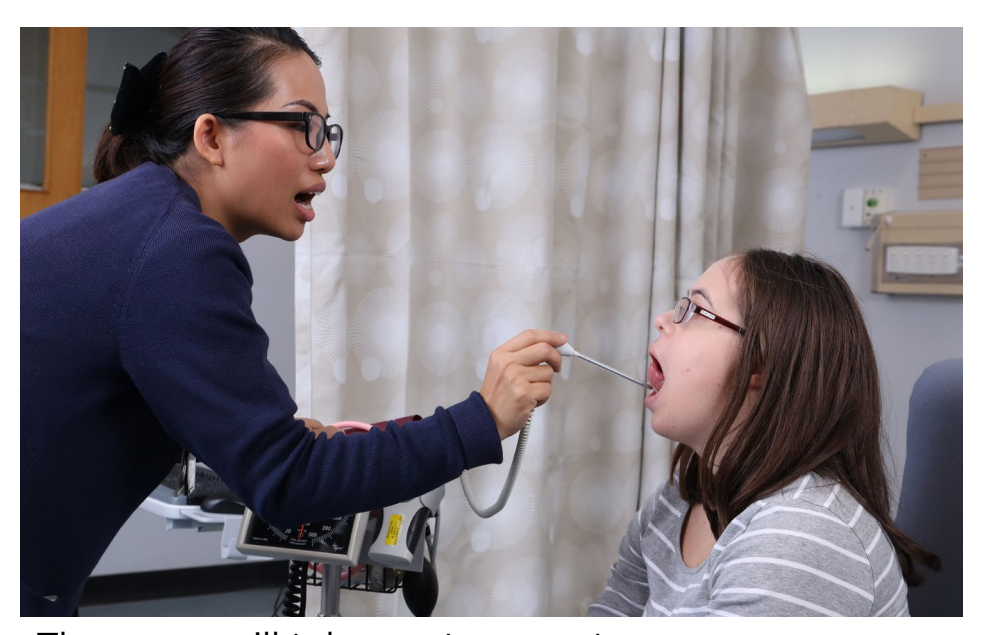
The nurse will take my temperature.