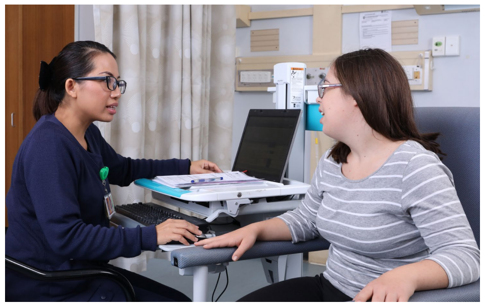
When it is my turn, the nurse will ask me questions.