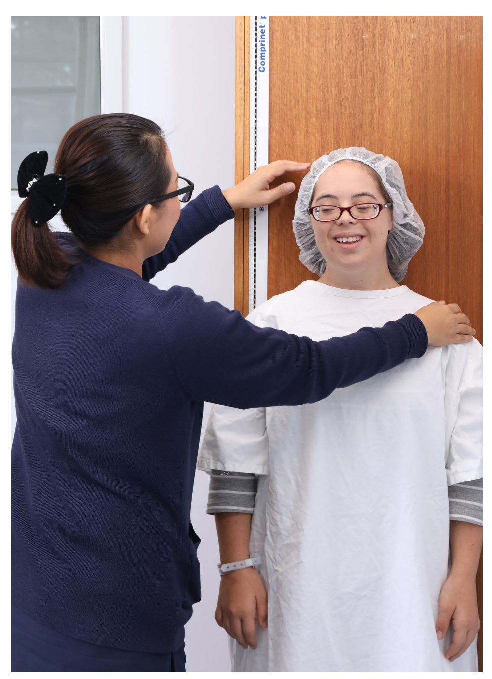
The nurse measures how tall I am.