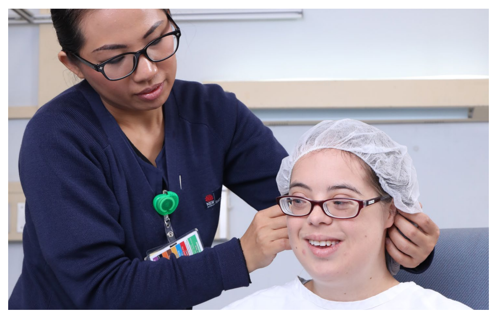
I have to get changed and put on a gown and cap.