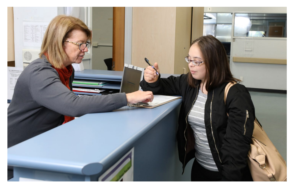
I check in at admissions.