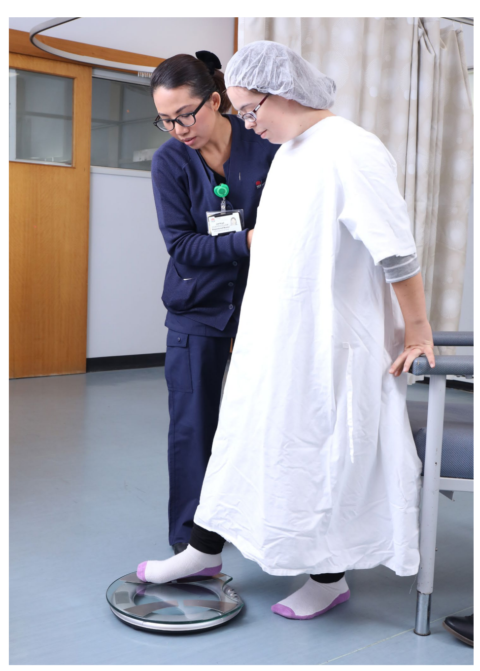
The nurse will weigh me.