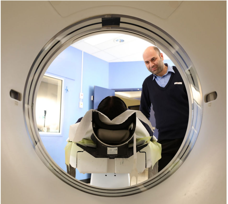
I might need to have a CT scan. Here is the CT machine.