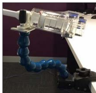
Custom fabricated clamp