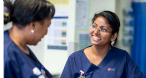
Continuous Capability Building