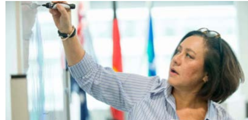
Specialist advice on healthcare innovation