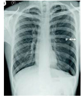
# measure the interpleural distance at the level of the hilum